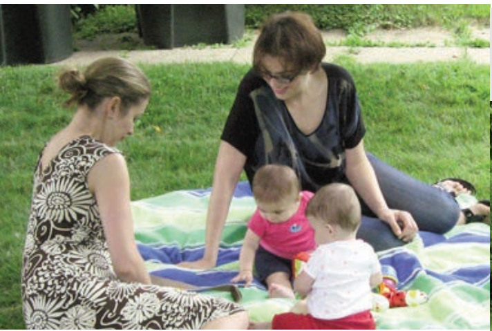
Close to 80 people came to what turned out to be an almost perfect day. The bouncy castle was immediately engaged by those 12 and under right from the start.

THANKS TO ALL WHO HELPED LAUNCH ANOTHER ACOM Annual Picnic on the side lawn of St. Sahag Church on August 11, 2013.