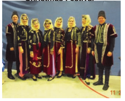
August 2015 Minnesota State Fair

December 2915 Ukrainian Christmas Festival