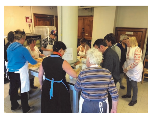
The Baking group

P.S. The recipes for both breads will be available on the ACOM Website.