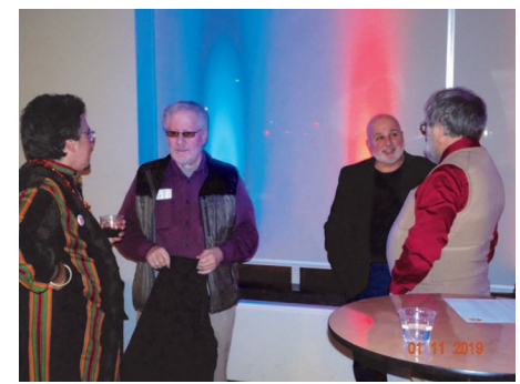
01 / 2019