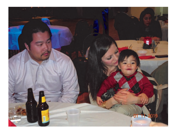
I brought my Parents...