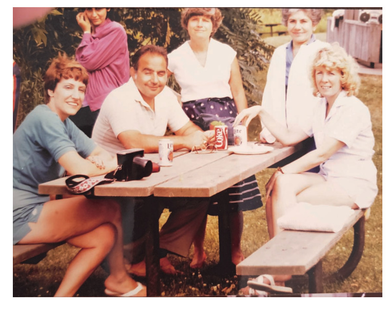
Answer hidden somewhere in this newsletter. ED.