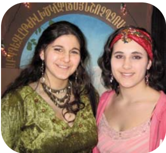
Two lovely young ladies who visited our exhibit from "Palestine".